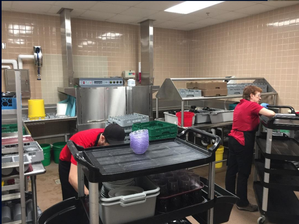
Dish & Pot wash now in same Room....was 50 ft apart!