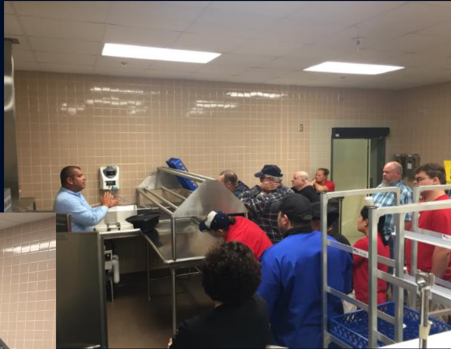
Vendor training on new Dish Washer