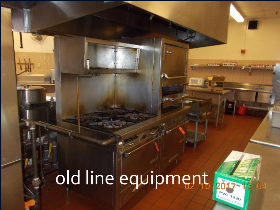
old line equipment